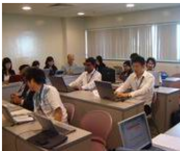
◀ 8 th APNG Camp: 18-20 July, 2006 National University of Singapore

APNG Camp is the camp for future internet leaders in the Asia Pacific Region where AP seniors and the Next Generation learn and work together. Sharing information among community promotes to activate Next Generation (APNG) activity through APNG Camp.