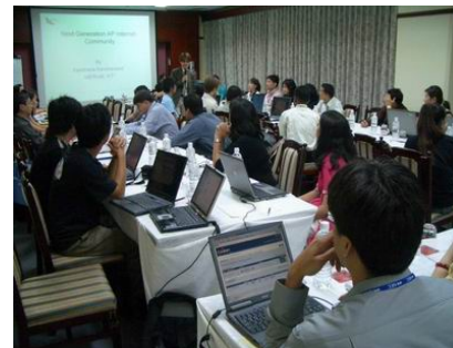
7 th camp: August 2005 Taipei, Taiwan