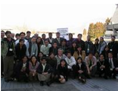
6 th camp: February 2005 Kyoto, Japan