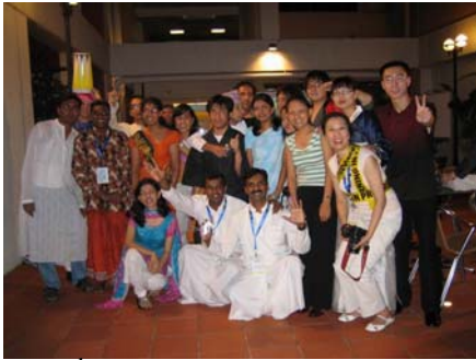
8 th Camp: 18-20 July, 2006 National University of Singapore