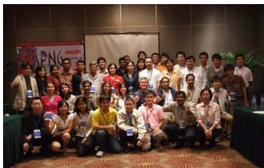
9 th Camp: 27 – 30 August 2007, Xi'an China

APNG Camp is the camp for future internet leaders in the Asia Pacific Region where AP seniors and the Next Generation learn and work together. Sharing information among community promotes to activate Next Generation (APNG) activity through APNG Camp.