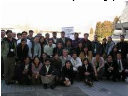
6 th Camp: February 2005 Kyoto, Japan