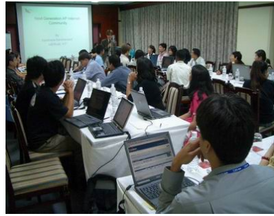
7 th Camp: August 2005 Taipei, Taiwan